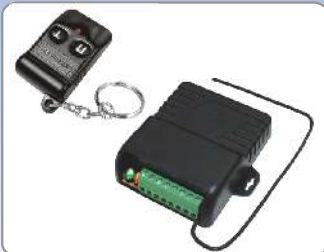
RF Transmitters & Receivers