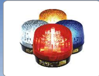
LED Strobe Lights