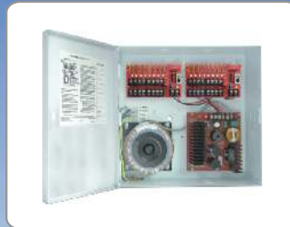
High-Amp CCTV Power Supply