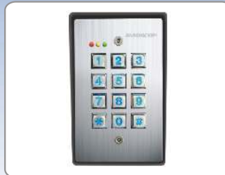
Digital Access Keypads